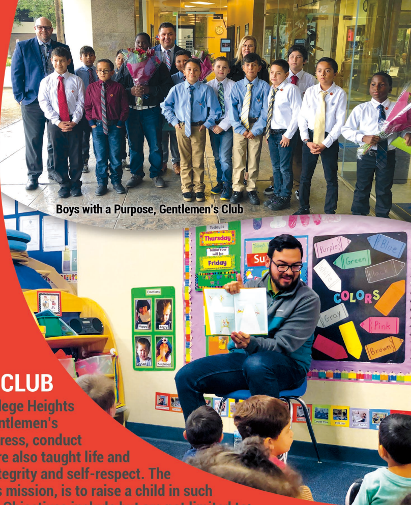
Boys with a Purpose, Gentlemen's Club

With the partnership of Bakersfield City School District, we provide Family Life Education to middle schools within the district. Students receive comprehensive Sexual Health Education and HIV prevention education from our trained instructors, utilizing Positive Prevention Plus evidence-based curriculum that complies with the California Healthy Youth Act.